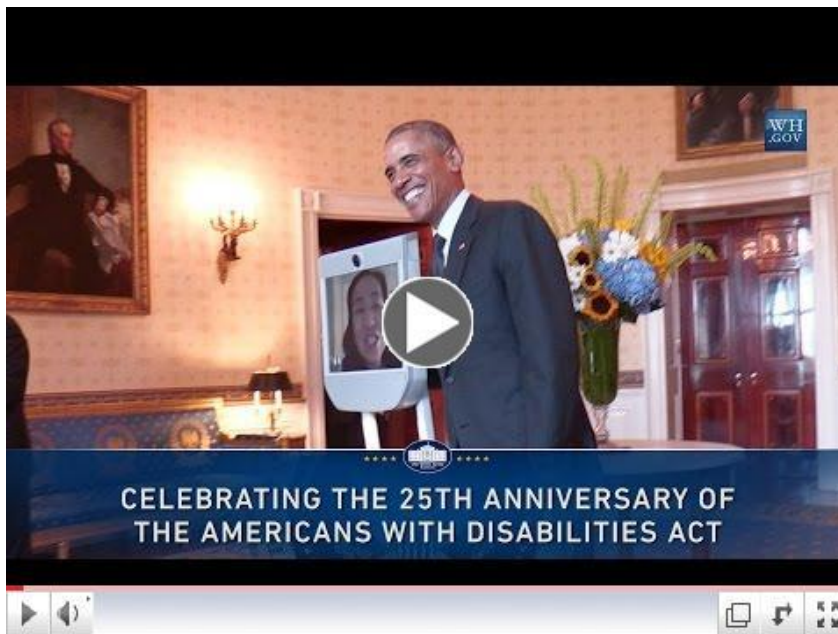
President Obama Celebrates the 25th Anniversary of the ADA

For more information on the ADA, www.ADA.gov , 800-514-0301.