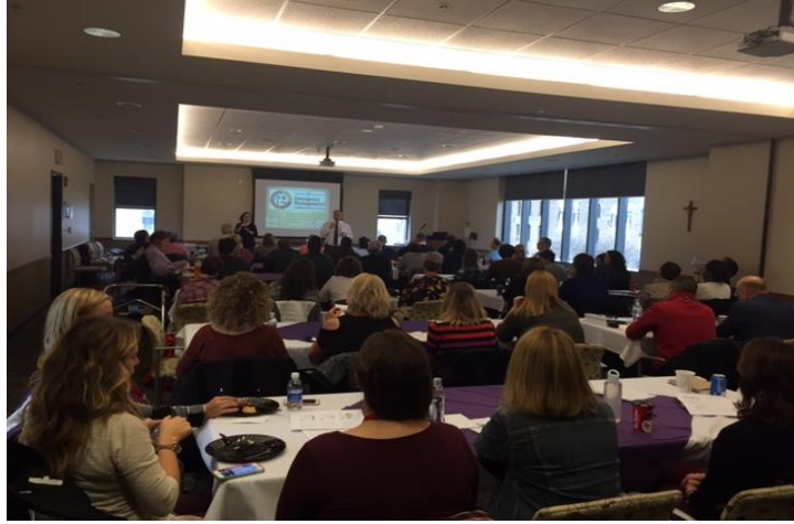
60+ Participants at the Niagara University Inaugural Emergency Management Disability Awareness Training